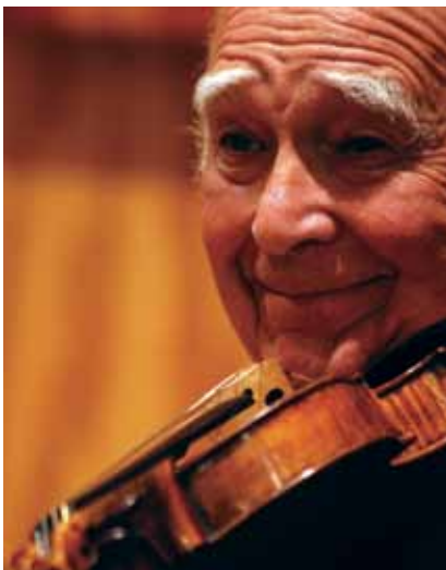
JOSEPH SILVERSTEIN , Conductor / Violin