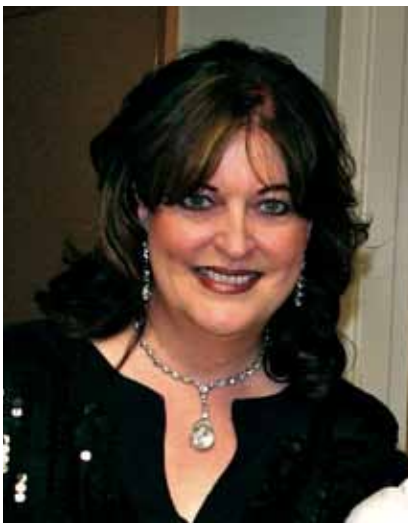
ANN HAMPTON CALLAWAY , Singer / Songwriter