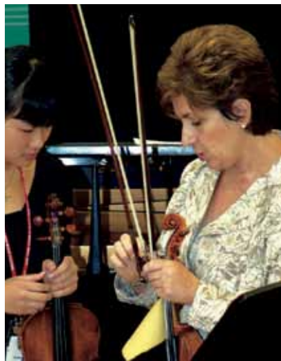
IDA KAVAFIAN , Violin